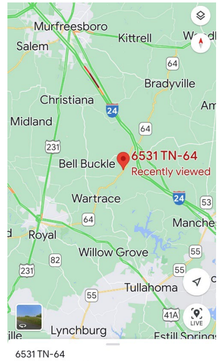
6531 TN-64, Bell Buckle, TN 37020

From Murfreesboro TN : Follow I-24 East towards Chattanooga. Take the TN-64 / Beechgrove Rd Exit 97 toward Shelbyville. Turn Right onto Hwy 64. Go 3.92 miles and Belle Meadow Farm will be on your Right. If you reach Lee Road, you have gone too far.