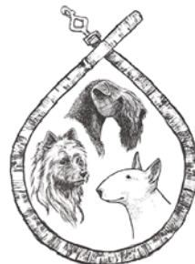
GATEWAY TERRIER ASSOCIATION